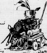
A safe Confound with the box.

Confound it! well, but, after all, the machine is not perfect! I have tried it with my own hands, and it is not so good as I thought it would be. I have tried it with my own hands, and it is not so good as I thought it would be.