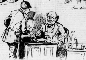
Merchant: 'Oh, for my! tell me your story to that machine and I'll print it out tonight.'