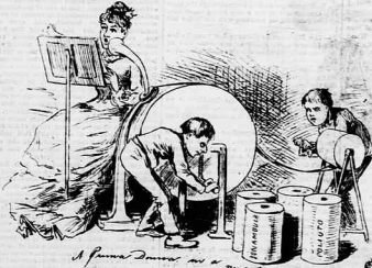
I found Devereux on a new track.