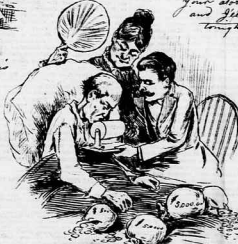
Recording the Melodious Will!