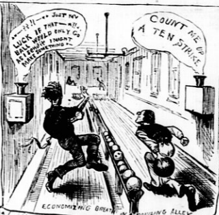
ECONOMIZING BIRTH AND PRODUING BELLY