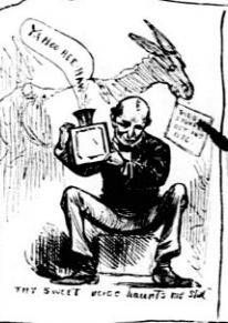
THIS SWISS VOICE WANTS TO BE SEEN