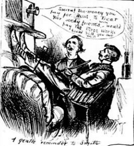
A gentle reminder to writers