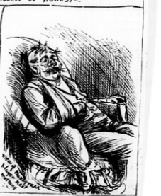
THE BEST PHONOGRAPH REQUIRED FOR EDWILLALLEN'S VOICE