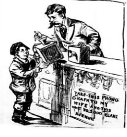
TAKE THIS PHONOGRAPH TO MY WIFE AND THIS ONE TO THE DOOR NUMBER