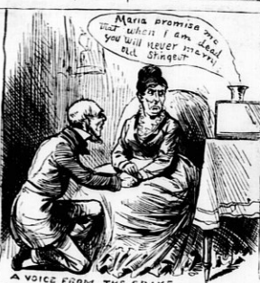
A VOICE FROM THE GRAVE