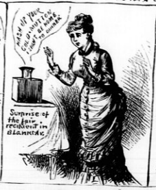
Surprise of the girl - PRODUCE IN SLEAZEBAG