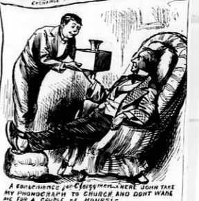
A BRILLIANTLY ENGAGEMENT HERE JOHN TAKE MY PHONOGRAPH TO CHURCH AND DONT WASTE ME FOR A COUPLE OF HOURS