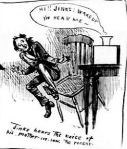
Jinks hears the voice of his mother-in-law the present