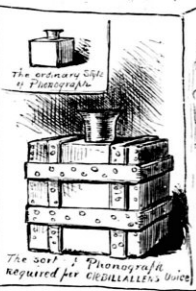
The best Phonograph Required for EDWILLALLEN'S VOICE