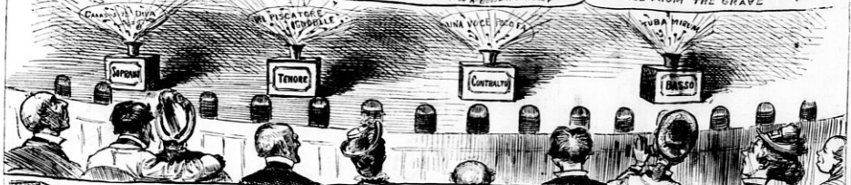
THE CONCERT OF THE FUTURE