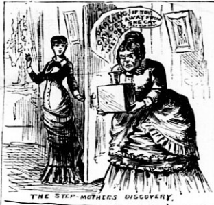
THE STEPP-MOTHERS DISCOVERY.